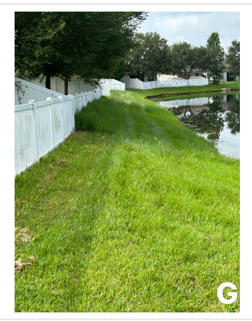
Some homeowners are letting their grass get very tall. Regular mowing will help to keep the mosquito and midge population down.